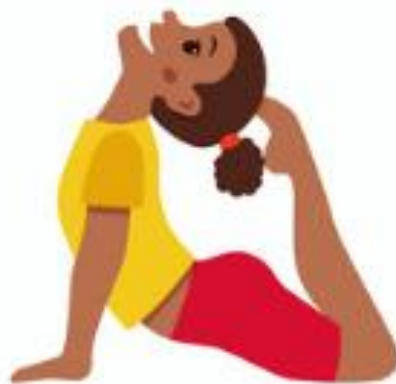
The Camel Pose