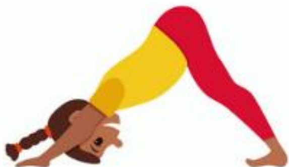
The Down Dog Pose