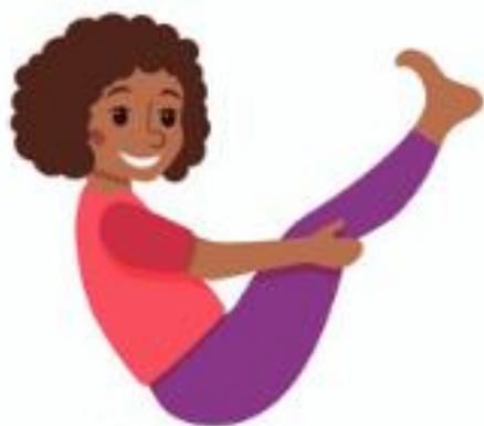
The Boat Pose