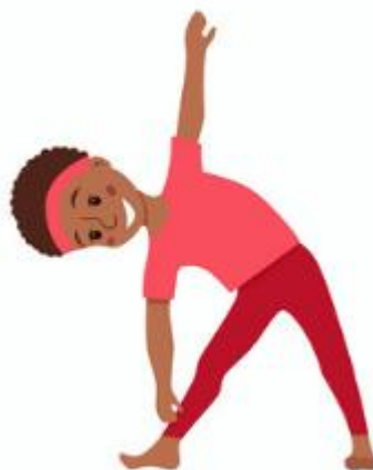
The Triangle Pose